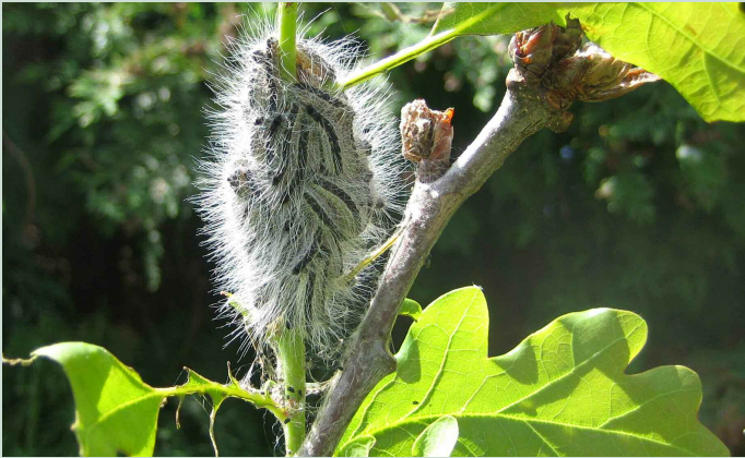
Caterpillars of the oak processionary moth – named after their habit of forming ‘nose-to-tail’ processions.

The oak processionary moth ( Thaumetopoea processionea ), a native of mainland Europe, is breeding on oak trees in Brent, Ealing, Hounslow, Richmond upon Thames and Hammersmith & Fulham Boroughs. Its caterpillars feed on oak leaves and produce silken nests on the trunks and branches of affected trees. As well as seriously damaging trees, the caterpillars can pose a risk to human and animal health.